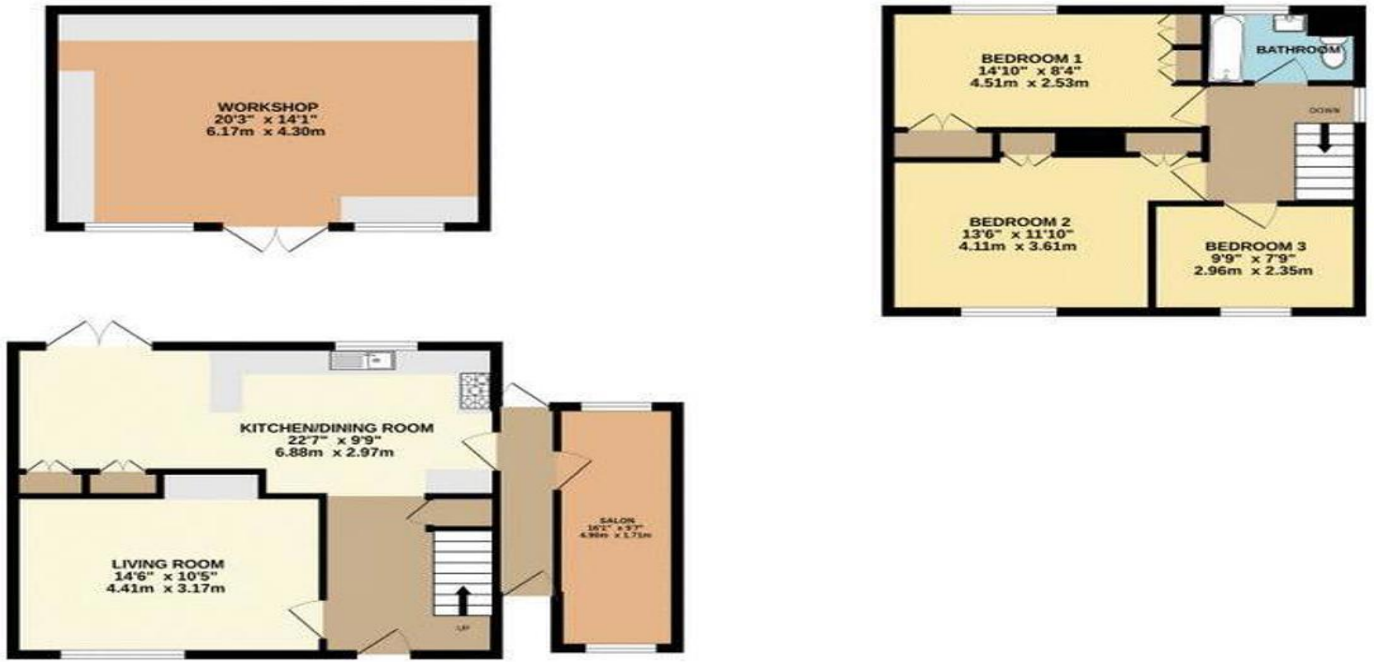
TOTAL FLOOR AREA : 1286 sq ft. (119.5 sq.m.) approx.

Whilst every attempt has been made to ensure the accuracy of the floorplan contained here, measurements of doors, windows, rooms and any other items are approximate and no responsibility is taken for any error, omission or mis-statement. This plan is for illustrative purposes only and should be used as such by any prospective purchaser. The services, systems and appliances shown have not been tested and no guarantee as to their operability or efficiency can be given. Made with Metropix ©2025